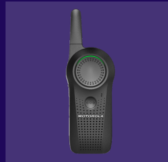
PMUF1983 Curve Radio