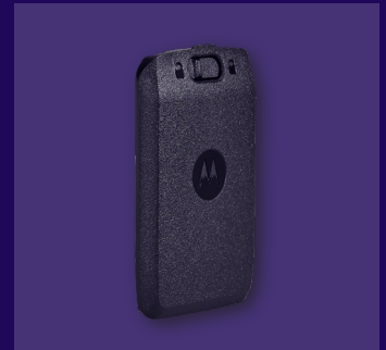
HKNN4013ASP01 BT90 Standard Capacity Battery