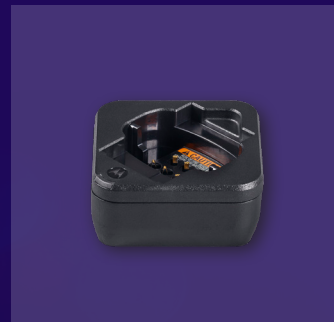
PMPN4587 SINGLE-UNIT CHARGER