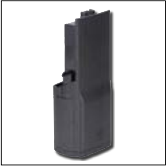
NNTN7033 IMPRES 4100mAh Li-Ion IP67 FM* Battery