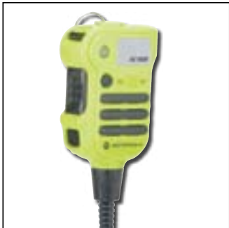
NNTN8203 IMPRES XE Remote Speaker Microphone with toggle volume switch, emergency button, strobe light, strobe light control button and programmable button. Windporting and Rugged.FM. Also available in black NNTN8203ABLK. (Not suitable for APX2000.)