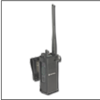
PMLN5657 APX6000 Leather Carry Case with 2.75" swivel belt loop for NNTN7038, PMNN4403, NNTN8092 batteries