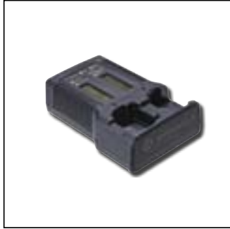
NNTN7596 Next Generation IMPRES Dual-Unit Charger with Display Modules