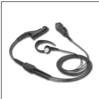
RLN5880 IMPRES 2-Wire FM* Surveillance Kit – Black (Beige RLN5881)