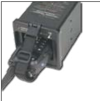
NNTN7616 IMPRES Vehicular Charger