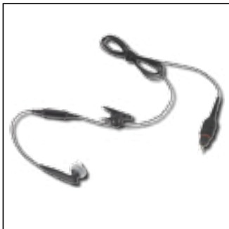
NNTN8295 Earbud with 45.7" cable