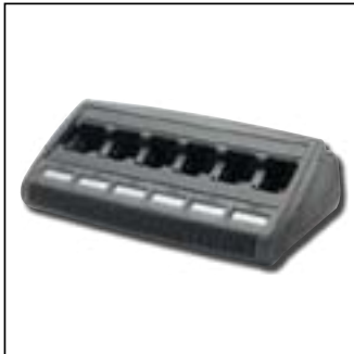
WPLN4222 IMPRES Multi-Unit Charger with Display Modules