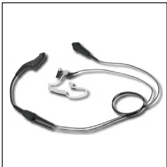
RLN5882 IMPRES 2-Wire FM* Surveillance Kit with translucent tube – Black (Beige RLN5883)