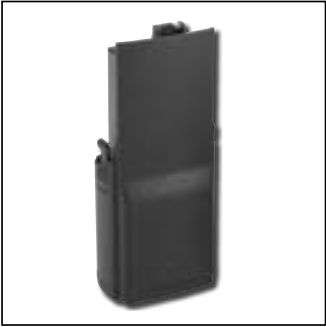
NNTN7036 IMPRES 2000mAh NiMH IP67 FM* Battery