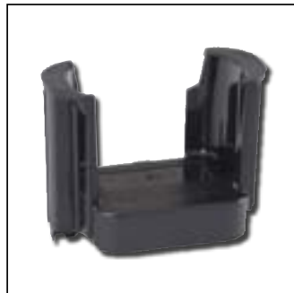
NNTN8170 Insert for XTS Multi-Unit Charger