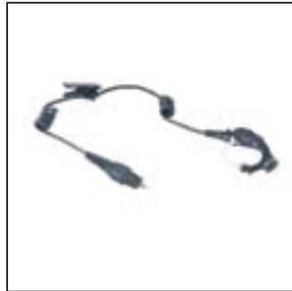
NTN2572 Over-the-ear earpiece 12.5" cord length