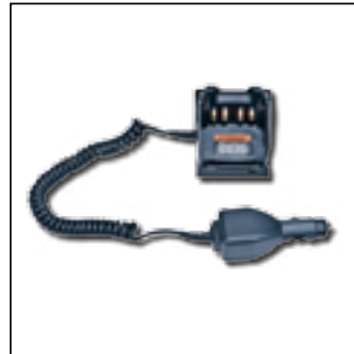
RLN6433 Travel Charger