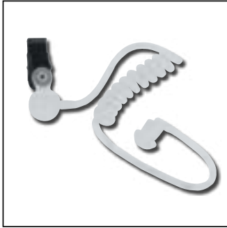
RLN5886 Low Noise Kit, includes 1 clear rubber eartip for low-noise environments (does not provide hearing protection)*