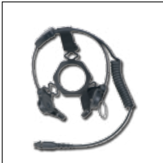
RMN5116 Receive and Transmit Boomless Temple Transducer FM* (For use with HMN4101 and HMN4104 Display RSM's)