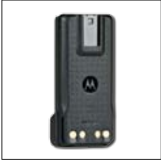
NNTN8129 IMPRES Li-ion 2300mAh FM Battery