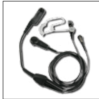
PMLN5111 IMPRES 3-Wire FM* Surveillance Kit with translucent tube – Black (Beige RLN5112)