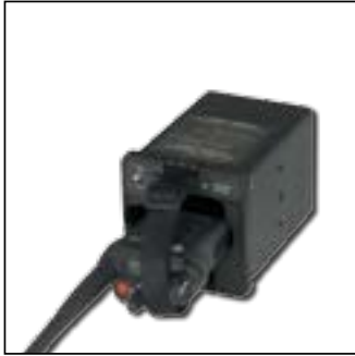
NNTN7624 IMPRES Vehicular Charger for APX7000, APX7000XE, APX6000 and APX6000XE