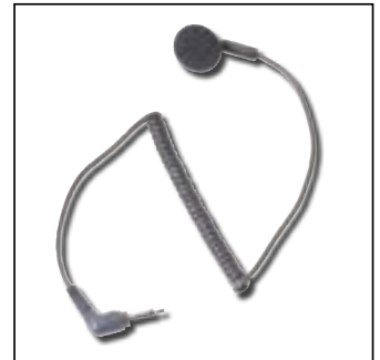
AARLN4885 Receive-only FM* Covered Earbud with Coiled Cord (for use with RSM's that have a 3.5mm audio jack)