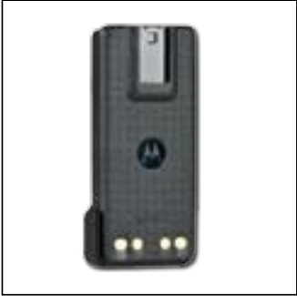
NNTN8128 IMPRES Li-ion 1900mAh Battery