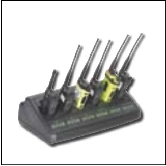
NNTN7063 IMPRES Multi-Unit Charger with Display Modules