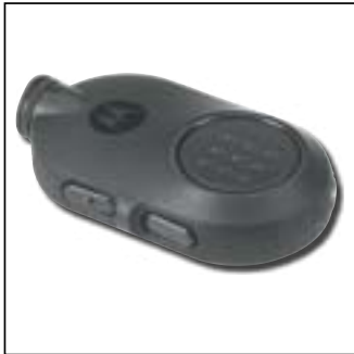
PMLN6053 Mission critical wireless POD and Micro USB plug in charger