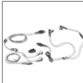
NNTN8296 Covert kit – includes the following: - 2-wire earbud, 116cm cord, Black (plugs directly into the pod) - 2-wire earbud, 116cm cord, White (plugs directly into the pod) - 1 wire single earbud w/Mic, 116cm cord - Commercial 3.5mm earbud headset adapter (plugs into pod and allows use of 3rd party earbuds)