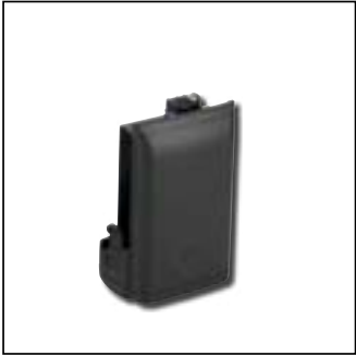
NNTN8092 IMPRES 2300mAh Li-Ion FM* IP67 Ruggedised Battery