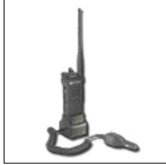
RLN6434 APX Travel Charger