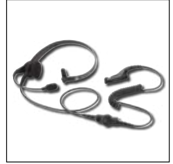
RMN5058 Light Weight FM* Headset, over-the-head, single-muff with in-line PTT