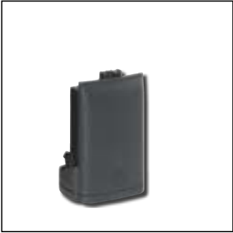
NNTN7038 IMPRES 2900mAh Li-Ion IP67 Battery

APX2000, APX6000, APX6000XE, APX7000 AND APX7000XE