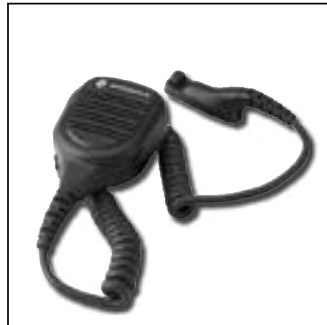
PMMN4065 IMPRES Windporting, Ruggedised FM* Remote Speaker Microphone with Volume Switch (hi/lo), Emergency Button and 1 Programmable Button