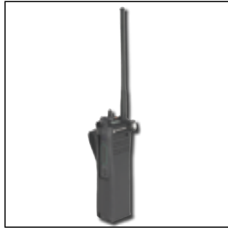
PMLN5327 APX7000 Leather Carry Case with 2.75" swivel belt loop for NNTN7033 and NNTN7034 batteries