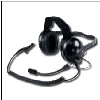
PMLN5275 Heavy Duty Headset Noise Reduction = 24dB