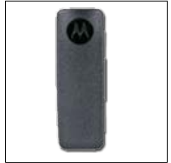
PMLN4651 APX2000 2" Hard Plastic Belt Clip