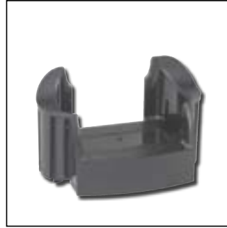
NNTN7687 Insert for WPLN4115 XTS Single-Unit Charger