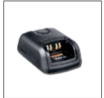
WPLN4256 IMPRES Single-Unit Charger