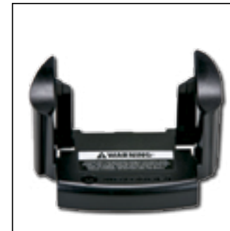
NNTN8169 Insert for XTS Single-Unit Charger