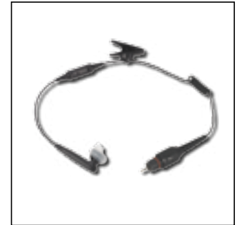
NNTN8294 Earbud with 11.4" cable and inline mic