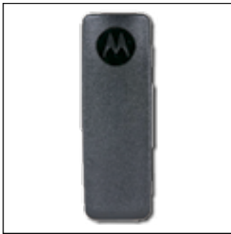
PMLN7008 APX2000 2.5" Hard Plastic Belt Clip

For a wide variety of carry solutions, please contact your Motorola Accessories manager