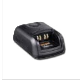
NNTN7083 IMPRES Single-Unit Charger