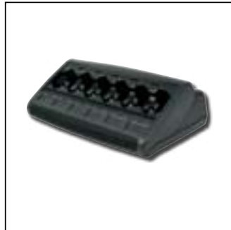
WPLN4215 IMPRES Multi-Unit Charger (non-display)