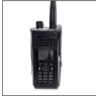
P MLN6085 APX2000 Leather Carry Case with 2.5" swivel belt loop, compatible with all APX2000 batteries