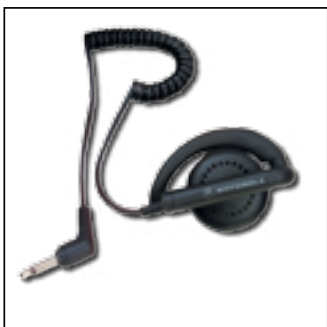
WADN4190 Receive-only Flexible Earpiece (requires audio jack RSM)