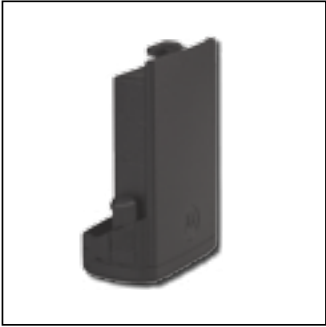
PMNN4403 IMPRES 2150mAh Li-Ion Slim IP67 Battery