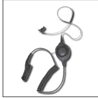
PMLN5653 IMPRES bone Conduction Ear Microphone System FM* IP54