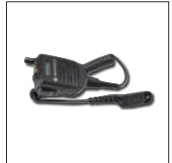
HMN4104 IMPRES Windporting and Ruggedised FM* Display Remote Speaker Microphone with 3.5mm Audio Jack, Channel Selector, Radio Volume Control, 2 Programmable Buttons and Emergency Button