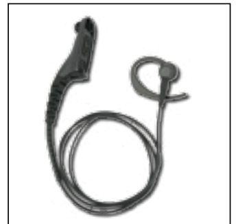
RLN5878 FM* Receive-Only Ear Piece – Black (RLN5879 Beige)