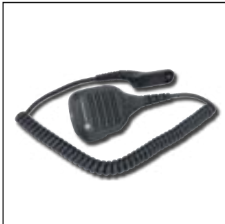
PMMN4062 IMPRES Noise Canceling IP54 FM* Remote Speaker Microphone with 3.5mm Audio Jack and Emergency Button