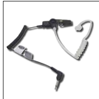
RLN4941 Receive-only FM* Ear Piece with Translucent Tube and Rubber Eartip (for use with RSM's that have a 3.5mm audio jack)