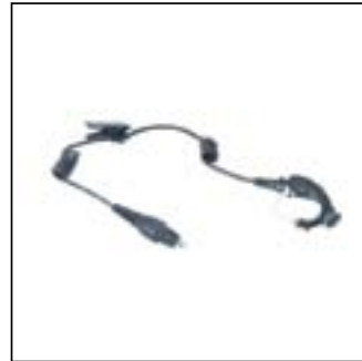
NTN2575 Over-the-ear earpiece 9" cord length